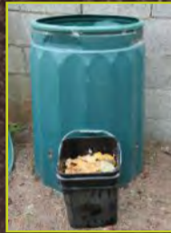
Fermented Food waste